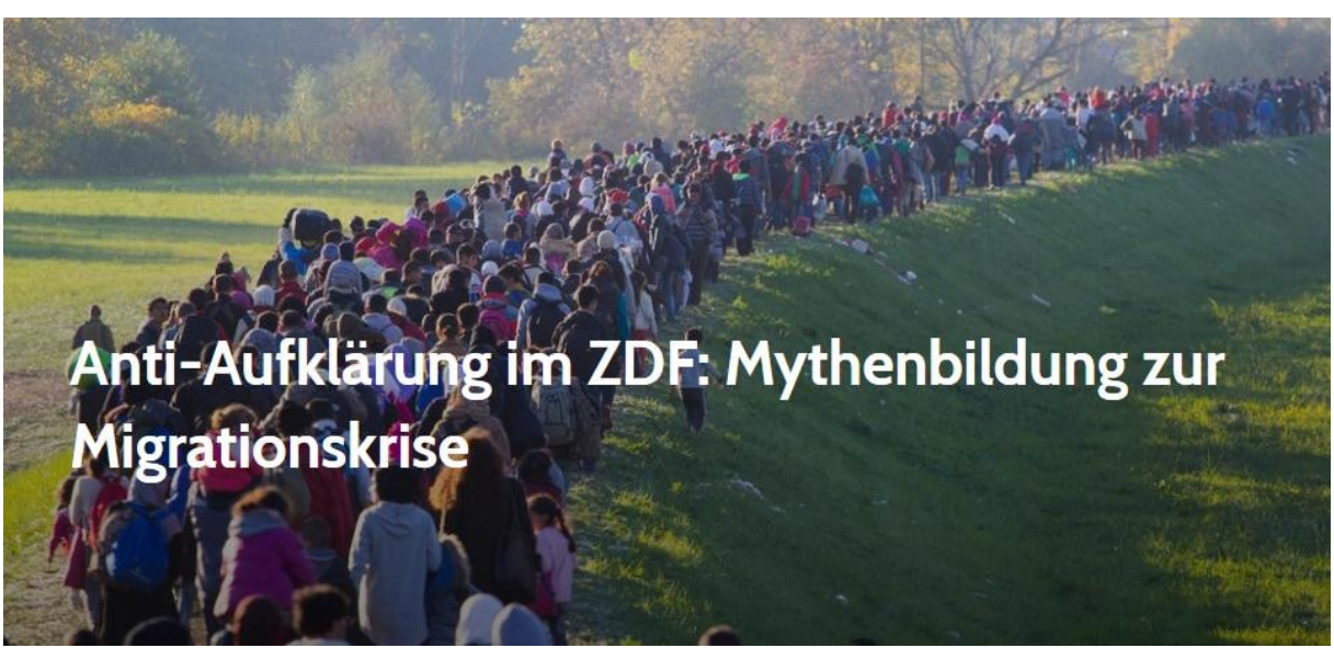
05. September 2019 at 13:20An article by: Tobias Bolt

Source: https://www.nachdenkseiten.de/?p=54573