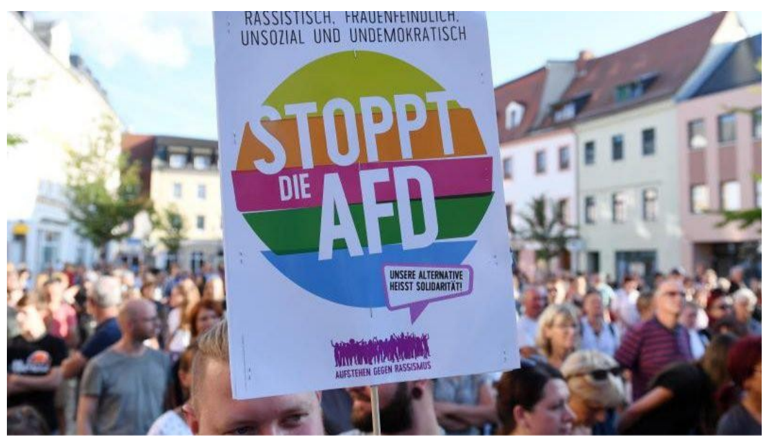
(Peter Haisenko)

The election campaign already showed that German politics is reduced to one issue: the old parties wanted to prevent AfD from coming into government somewhere.